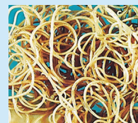
Roundworms are long, white and spaghetti like.

Adult roundworms shed eggs which are passed out in your pet's faeces and infect the environment. The eggs become infective within a few weeks and pets can become re-infected by unwittingly eating the eggs, often whilst grooming. Additionally the eggs can pose a risk to humans if accidentally ingested.