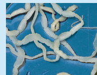
Tapeworms are long segmented worms which shed segments.

Lungworm: The two main lungworms of concern are Angiostrongylus vasorum in dogs and Aelurostrongylus abstrusus in cats. In dogs the main way of catching this lungworm is if they eat slugs or snails which often happens when they eat grass. The worms eventually migrate to the lungs where they can cause a cough, breathing difficulties or heart failure. However the worms also cause bleeding which means clinical signs can vary depending on where the dog bleeds (e.g. seizures due to bleed on the brain). In cats, they become infected in a similar way or even if they eat infected prey. Cats may show coughing, breathing difficulties, weight loss and poor appetite. With all lungworms, due to the severity of signs shown, this can make pets really unwell.