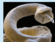
Electron-micrograph of an adult A. vasorum.

Regular prescription worming and flea treatments for your pet, picking up dog faeces, good hand hygiene, plus attempting to prevent your dogs eating slugs and snails, will all help to keep you and your pet safe.