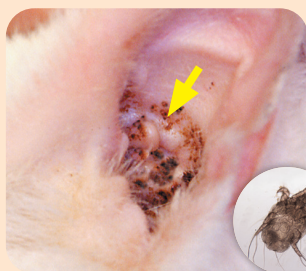
Opening to the vertical ear canal in a cat with a crusty brown discharge typical of ear mites Otodectes cynotis (inset)