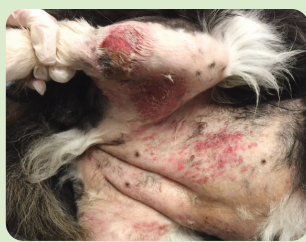
Typical photo of a suspected case of Alabama Rot with skin lesions

Alabama Rot is a disease that has been hitting the headlines recently. It has gained attention because it is hard to diagnose but is often fatal. However, it is important to remember that it is also very rare.