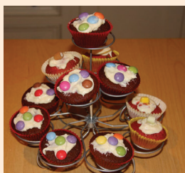
Beware of cakes (including many home made cakes) made with the artificial sweetener xylitol, which is extremely toxic to dogs.