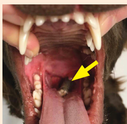
This is a typical stick injury where the stick has become lodged in the dog's throat – see yellow arrow.

Finally – we hope you enjoy the spring with your pets. Signs of poisoning can often be quite vague so please contact us at once if you are at all worried.