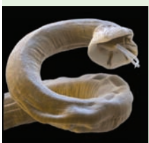
Electron micrograph of an adult lungworm

Lungworm are swallowed as tiny larvae, which migrate into the circulation of the liver and travel to the right side of the heart. Here they develop into adult worms (see photo left) which can build up in the heart. Here the adults mate and produce eggs. The eggs hatch into larvae and then migrate into the lung tissue. These larvae are coughed up and are passed out into your dog's faeces to re-infect molluscs.