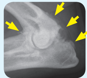
Arthritic elbow joint in a dog with lots of "fluffy" new bone (yellow arrows) around the joint, indicative of marked arthritis.