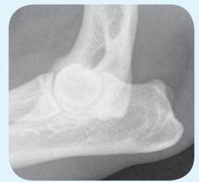
X-ray of a normal elbow joint

Radiography is commonly used to investigate joint problems.